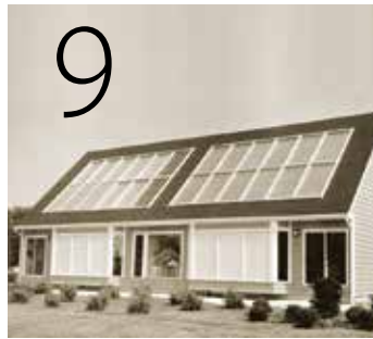
9 INVENTOR _____

A former slave, she moved to Chicago after the Civil War to open a furniture store. The cabinet bed she invented looked like a desk when folded up. It was designed to maximize the space in small rooms. She was the first African American woman to receive a U.S. patent. Hers was granted on July 14, 1885.