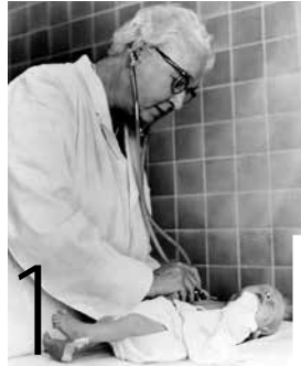
1 INVENTOR _____

She received a patent for her "window cleaning device" in 1903. Within about a decade, the windshield wiper would become standard equipment on American cars. Hers was operated via a lever inside the vehicle.