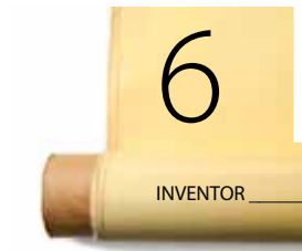
6 INVENTOR _____

This University of Delaware scientist, known as the "Sun Queen," designed innovative technology for Solar One, UD's experimental solar-powered house. She was posthumously inducted into the National Inventors Hall of Fame in 2012.