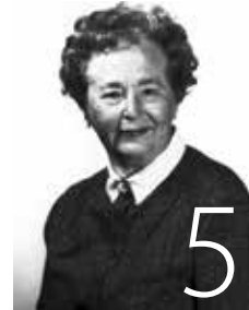
5 INVENTOR _____

The first U.S. patent granted to a woman was in 1809 for a new process for making straw hats and bonnets. Since then, women have patented thousands of inventions, from the wringer washer to cancer-fighting drugs. Can you correctly match the inventor to her picture or invention?