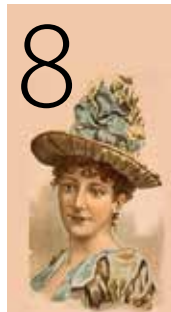
8 INVENTOR _____

While a chemist at DuPont, this Delaware resident invented Kevlar, the strong-as-steel synthetic fiber used in tires to bullet-proof vests. Police officers and other members of a Kevlar Survivors' Club tell how this novel fiber saved their lives.