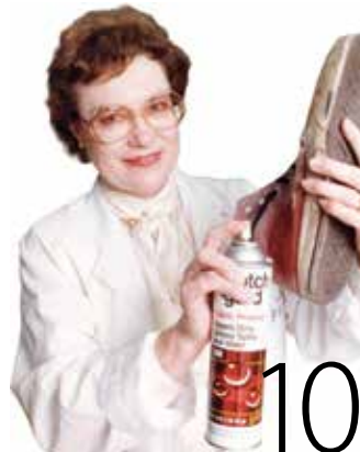
10 INVENTOR _____