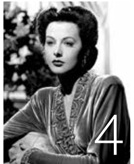
4 INVENTOR _____

Baby's first test is named after this physician. Her simple evaluation of a newborn's condition, first published in 1953, checks a new baby's "appearance, pulse, grimace, activity and respiration" at one minute and five minutes after birth.