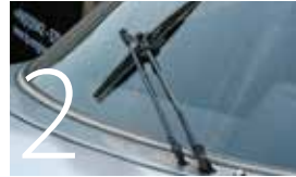
2 INVENTOR _____