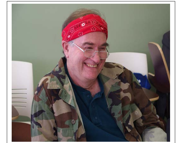
Here are some photos of members enjoying the Spring 2018 End of Year Luncheon and Hair, The Musical.