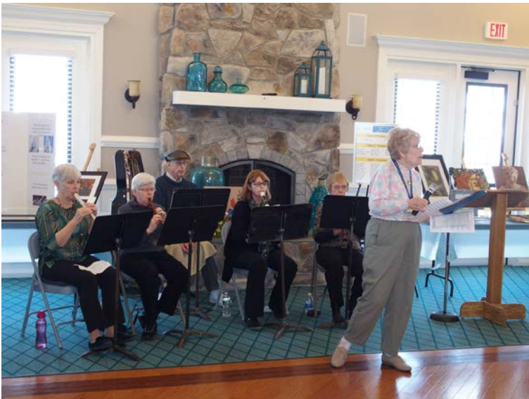
Spring 2018 End of Semester Luncheon

When you give back to OLLI, you make members' dreams possible, the University of Delaware stronger and our community stronger. No matter how big or small, every gift truly matters.