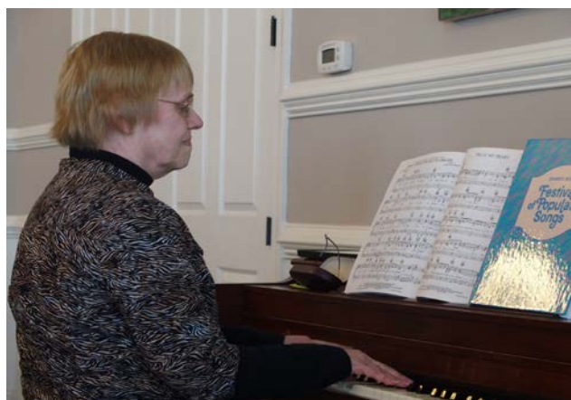
Spring 2018 End of Semester Luncheon