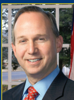
Jack Markell Governor State of Delaware