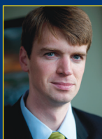
Collin O'Mara Secretary Delaware Department of Natural Resources and Environmental Control