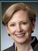
Ellen Kullman CEO DuPont