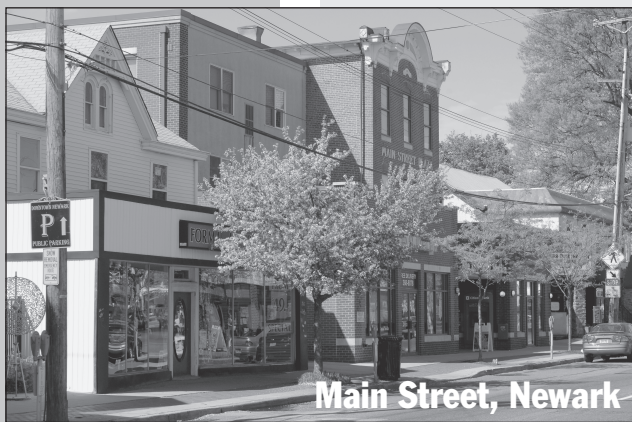
Main Street, Newark

A visit to the University of Delaware isn't complete without a stroll down Main Street where you'll find plenty of options for dining, shopping, and animated conversations over coffee.