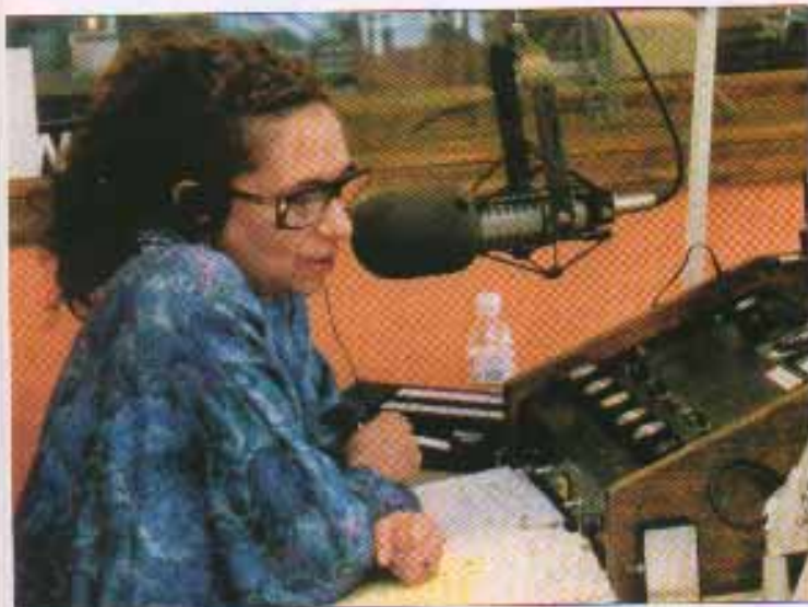
In Radio One's early days, Cathy Hughes stirred up listeners.

Hughes' style of buying and reformatting stations seems to be working. According to recent figures from Arbitron, a New York-based media research and marketing firm, Radio One stations have the No. 1 spot and tie at No. 4 in Baltimore. Her two biggest Washington, D.C., stations, WKYS and WMMJ, are ranked third and fourth, respectively, among the city's 36 Arbitron-ranked stations. After Radio One purchased WPHI in Philadelphia in 1997,