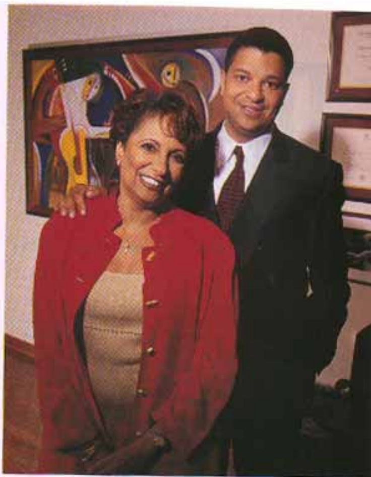
Cathy Hughes and son, Alfred C. Liggins III, are close.

Hughes, 52, puts it more bluntly. "What the IPO has done is allowed us to stay in the game and remain a viable player," she says, while leaning forward in her chair to light up her sixth Benson and Hedges Ultra Light cigarette in 2 1/2 hours. The public