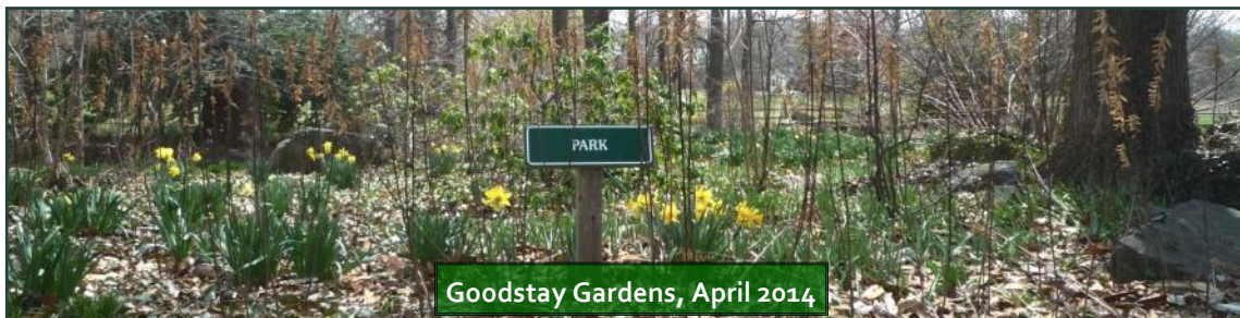
Goodstay Gardens, April 2014

As you can see, these courses cover a wide range of topics and allow you to try something new and interesting!