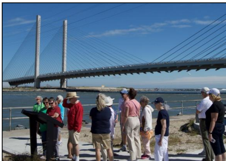
From The Tides , newsletter of OLLI-Lewes/Ocean View, Fall 2016

From 2005 to 2016 OLLI at Widener University was at the Exton, PA campus. In mid 2016 Widener relocated its OLLI to its main Chester campus. Many former members created a new home—the LifeLong Learning Institute at Immaculata University. OLLI Widener also offers a number of courses at partner senior organizations such as Maris Grove.