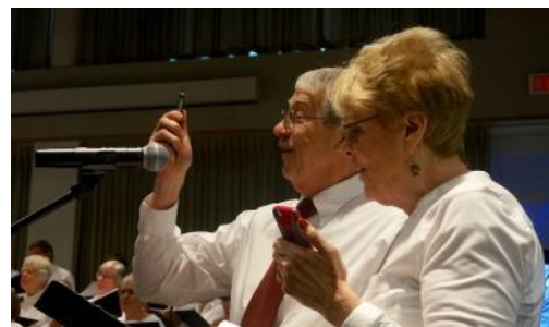
Texting a Merry Christmas