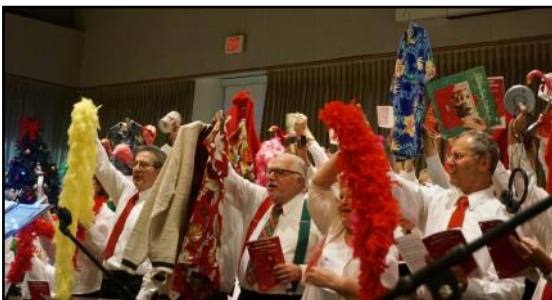
Regifting a Merry Christmas