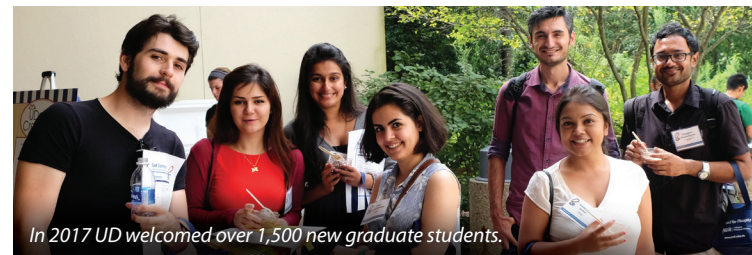
In 2017 UD welcomed over 1,500 new graduate students.