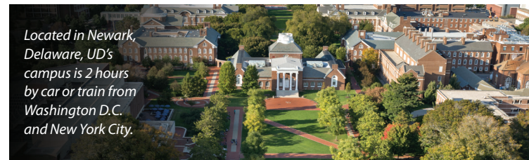
Located in Newark, Delaware, UD's campus is 2 hours by car or train from Washington D.C. and New York City.

UD is truly global, with teaching, research and public service efforts underway around the world, including 175 UD Global Agreements with institutions from 54 countries.