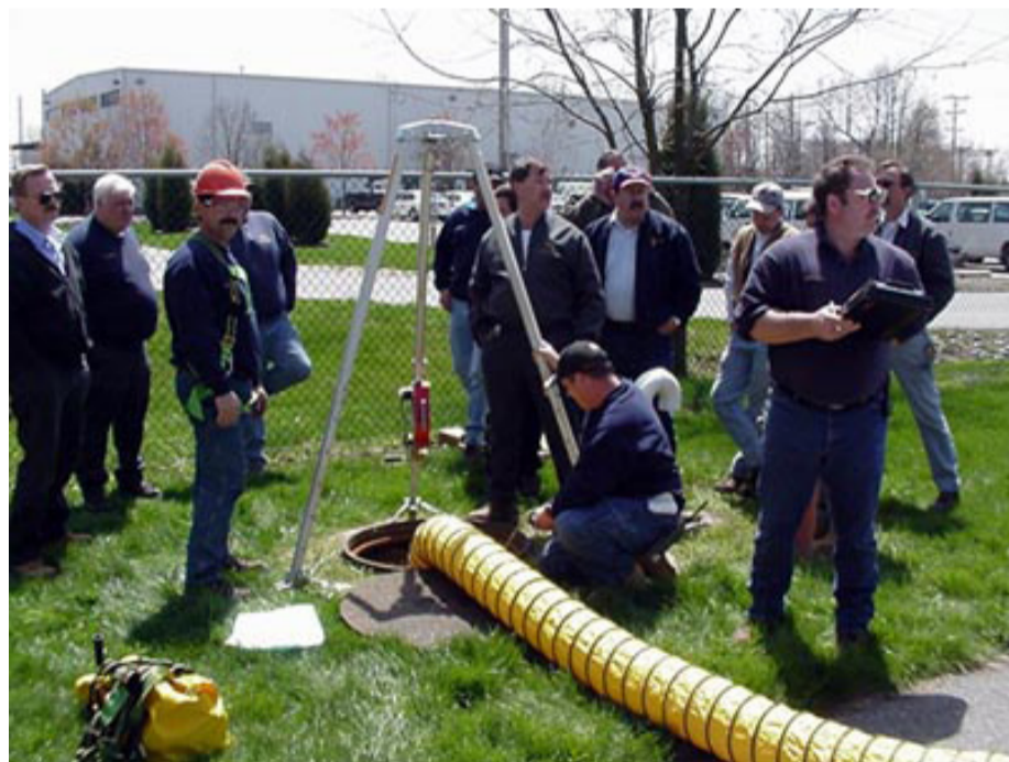
University of Delaware Facilities employees participate in Confined Space training at the Material Management Facility here on campus.