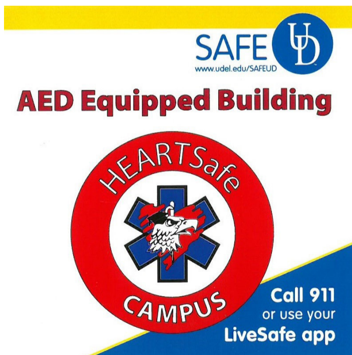
Sample of the stickers located on AED equipped buildings

For a complete list of AEDs on campus, go to http://www1.udel.edu/ehs/generalhs/aed-locations.html or check the Campus Maps for buildings that have a heart symbol on them. If you click on the heart symbol, you will see the specific location of the AED within that building.