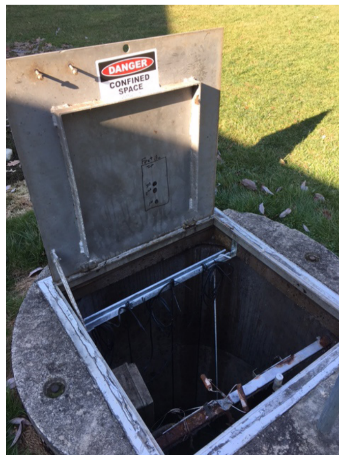
A confined space manhole at 501 South College Avenue