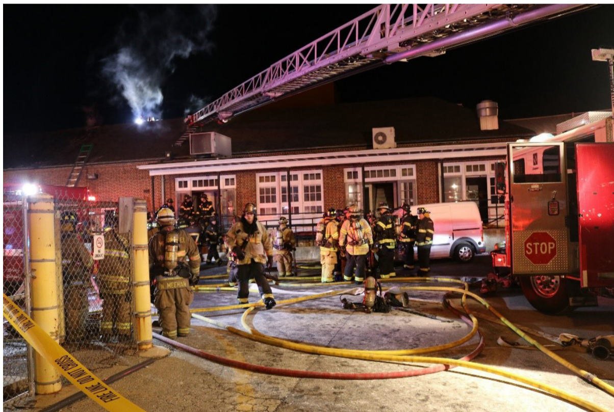
Firefighters work to put out the blaze on January 30, 2018

A recent fire at Facilities Maintenance and Operations was determined to be accidental by the State Fire Marshal's Office. The January 30th Fire started in a 2nd floor office suite on the south wing of Facilities Maintenance and Operations at approximately 6:00 pm. University Police, Aetna Fire Department and other mutual aid fire companies, along with EHS responded to the stubborn fire. Fire crews were finally able to make headway and stop the fire after cutting into the slate with concrete deck roof system. The contents provided enough fuel to sustain the fire once started. The fire disrupted the Maintenance and Operations Department, including the relocation of the 1141 Service Call. Many of the other trade shops including but not limited to Electronics, HVAC and BAS staff were relocated and are functioning. The ability of Electronics and others enabled restoration of the fire alarm system which allowed many of the shops further from the fire to return to normal operations.