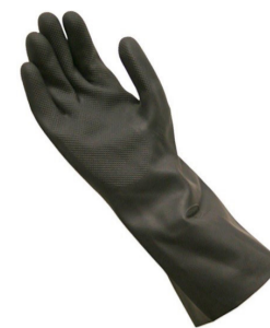
Neoprene Gloves (for HF use)

Have you ever used a chainsaw to cut a sandwich? Pliers to pluck your eyebrows? No, because that would be nonsense. It's the same idea for choosing gloves inside the lab. One must select the proper glove to get the adequate protection for any job that you may be doing. Gloves are made of various materials and each has a unique function, i.e., chemical resistant gloves, cut resistant gloves, temperature resistant gloves, etc.