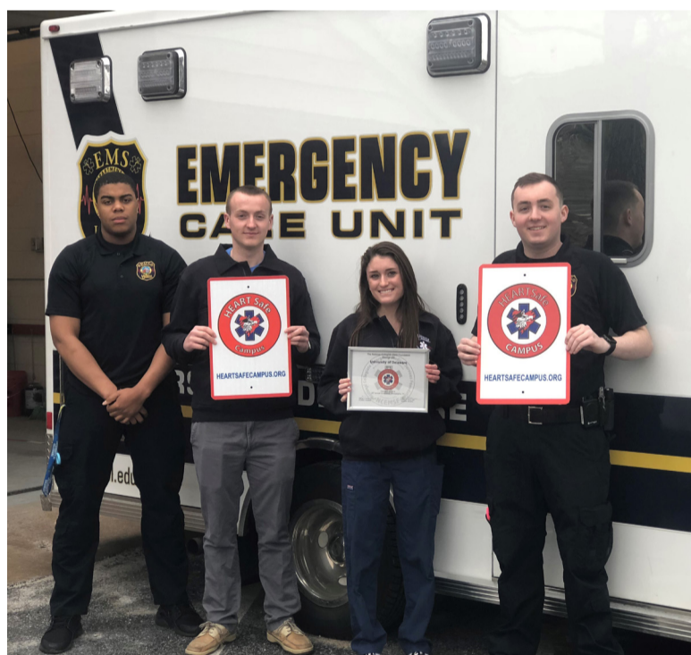
UDECU Members hold up the HeartSafe Campus award

For more information on CPR classes or the AED program, visit UD's Environmental Health and Safety website .