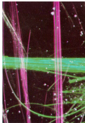
Microscopic view of asbestos fibers