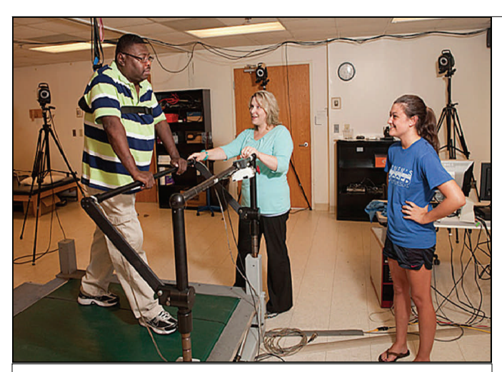
UD's DPT program provides students with a rich clinical and research environment while also offering undergraduates the opportunity to gain valuable experience in the clinic and the lab.

The University of Delaware's Department of Physical Therapy has been chosen through a national nomination process as one of four exemplar sites participating in a national study of physical therapist education.