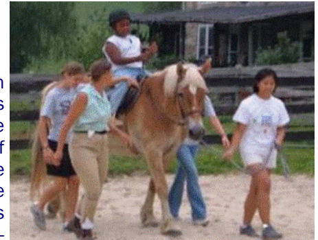
Above: DPT students at Freedom Hills' Therapeutic Ridings.

Screening, and both the Cystic Fibrosis Foundation and the MS Society's Golf Tournaments. The DPT students were also active in UD's field hockey and lacrosse games as ticket sellers and spotters, and they were also involved with the PT Department's open houses and interviews for the incoming DPT class. We look forward to continuing and expanding our service to the community during the upcoming year!