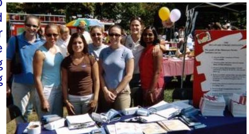
Below: DPT I and II students volunteer for the DE Stroke Initiative's Stroke Screenings.