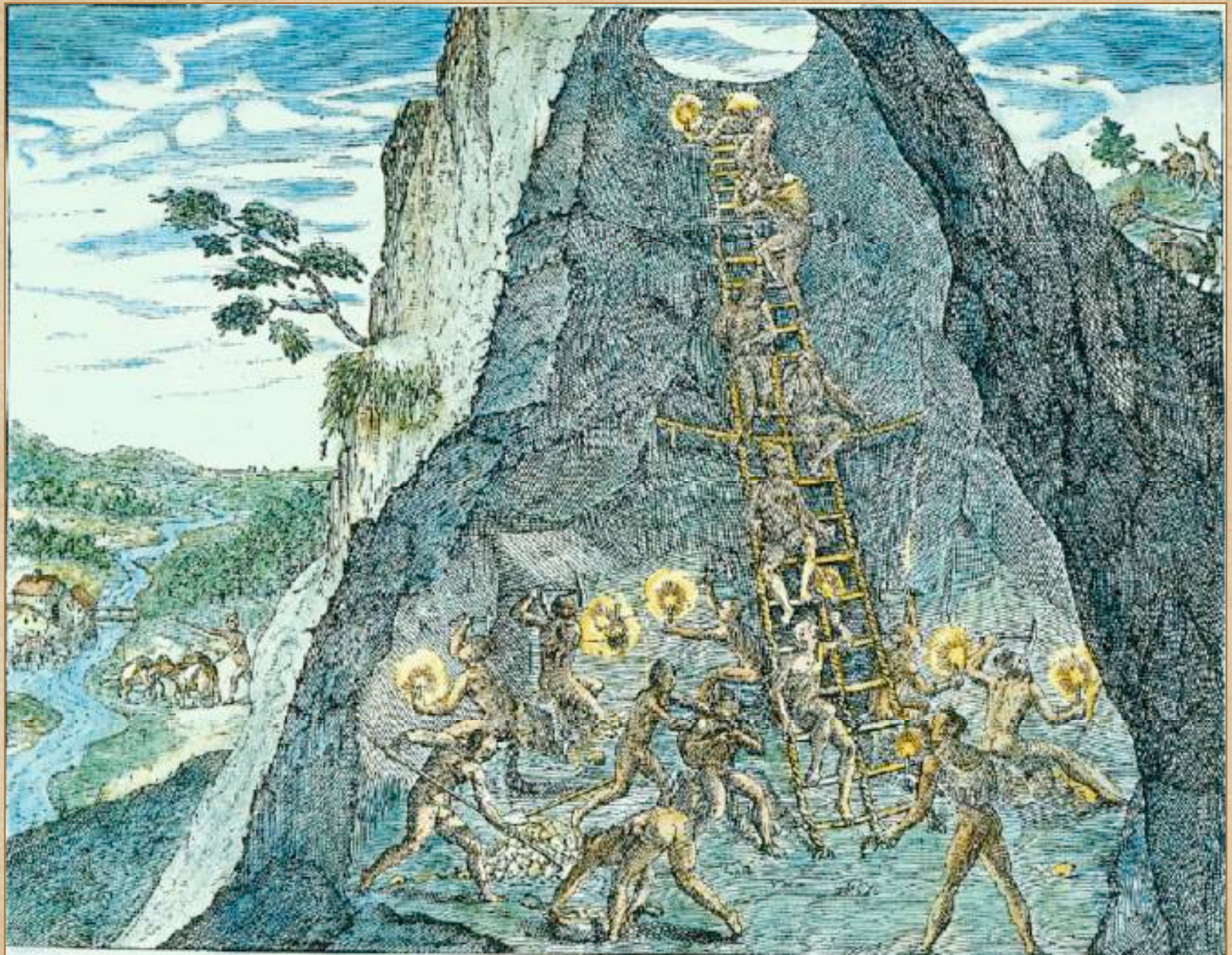
Conscripted Indians working a silver mine