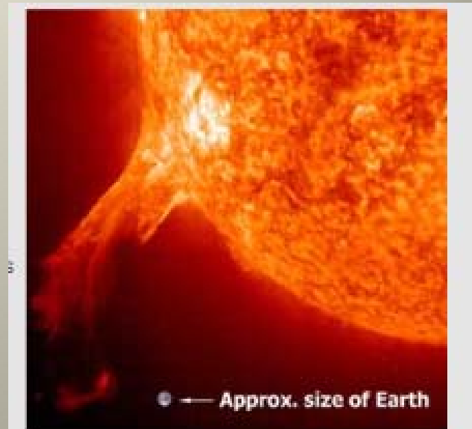
A image from the Solar and Heliospheric Observatory (SOHO) shows an erupting coronal mass ejection, with an Earth inset at the approximate scale of the image.

We call it “Weather” because we like to use the term “Solar Storm”