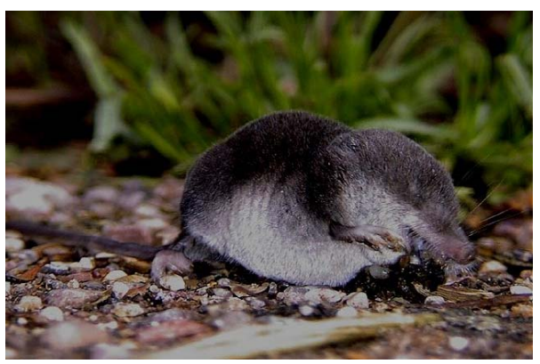
Mouse Rat Shrew