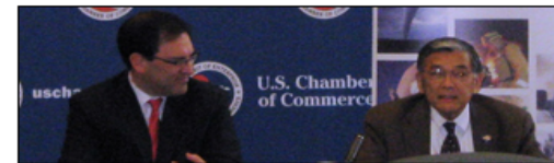
Secretary Norman Y. Mineta hosted a joint press conference at the U.S. Chamber of Commerce